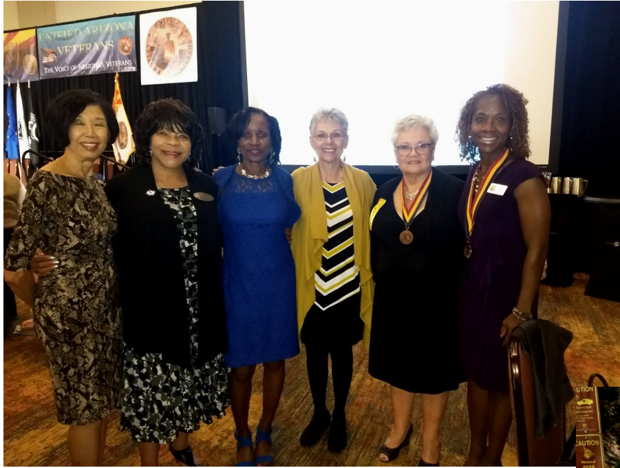
Left: Arizona Veterans Hall of Fame October 2019.