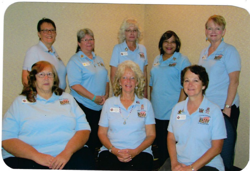
2015 – 2016 Line Officers