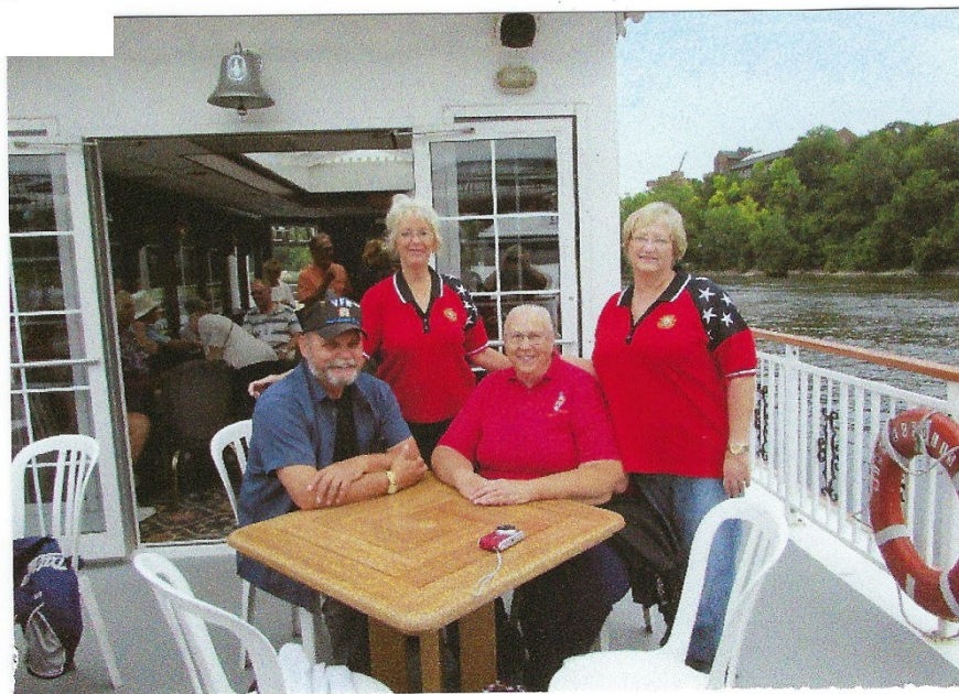
Mid - Winter